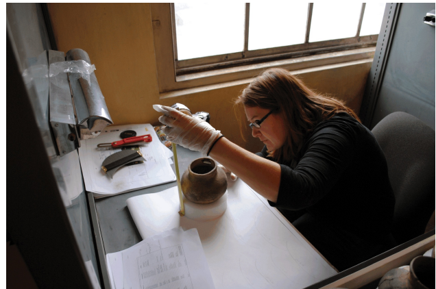
A mount fabricator measures a vessel to be on display in "The First Alabamians"

the previous Indian exhibit, the new design will accommodate a larger number of pieces from the department's collections, plus artifacts on loan from other museums.